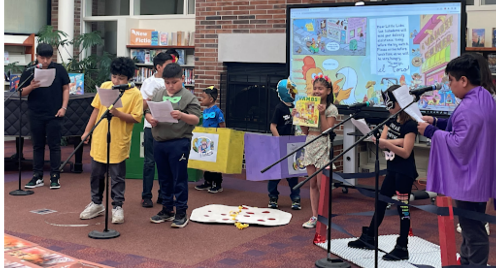
La Conexión children performing at Book Fiesta event at the WC DPL